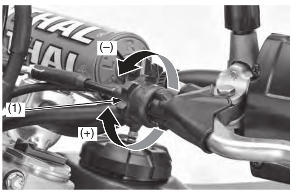
(1) clutch cable end adjuster (+) increase freeplay (-) decrease freeplay

Turning the clutch cable end adjuster (1) in direction (+) will increase freeplay and turning it in direction (-) will decrease freeplay.