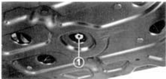
(1) Oil drain plug

with the rubber on oil filter facing out and install the cover using the screws. Tighten the screws securely.