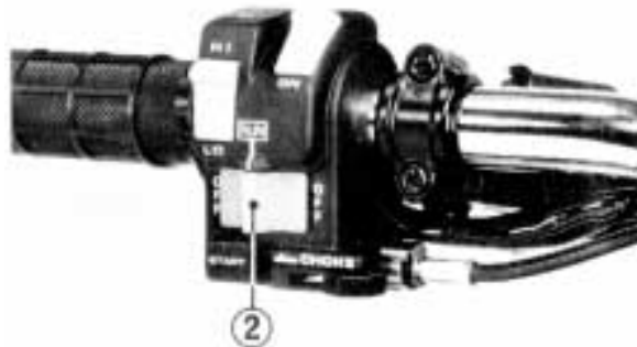
(2) Engine stop switch