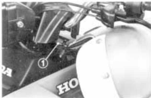
(1) Helmet holder

* Do not operate the TRX with a helmet attached to the holder. The helmet holder is designed for use while parked.